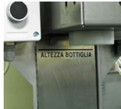
Fig. 1. Bottle Height---Top of bottle MUST be at this height or slightly higher.